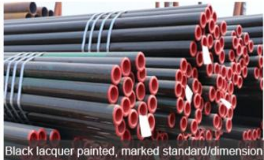
Black lacquer painted, marked standard/dimension